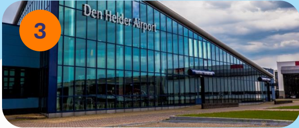
Den Helder Airport